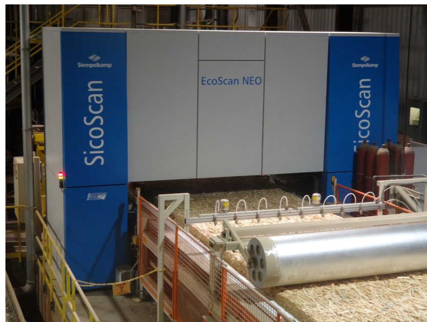
Figure 1: X-ray area weight measurement and foreign body detection installed in OSB forming line.

the forming line is introduced under the brand EcoScan NEO. It has been developed by EWS in cooperation with Siempelkamp, Germany and offers one system with independent X-ray devices for individual tasks. These comprise: