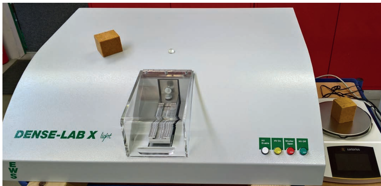
Above: Figure 1 – laboratory density profile analyser DENSE LAB X light with optimised X-ray technology for insulation material

X-ray systems for inspection and measuring tasks have been prevalent in wood-based panel production for many years. However, as Konrad Solbrig, head of technology wood-based composites at Germany-based EWS reports, the latest research and development enables new systems with innovative features to meet the increasing requirements