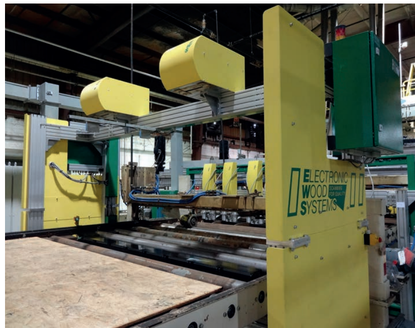
Above left: Figure 2 – Traversing area weight gauge MASS-SCAN X ME with MultiEnergy technology for various measuring tasks in panel production